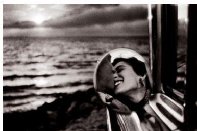
002 ELLIOTT ERWITT (* 1928) California, USA 1955

Gelatin silver print, printed in the 1990s, 29,8 x 44,5 cm Signed by the photographer in ink in the margin, signed, titled and dated by the photographer in pencil on the reverse PROVENANCE in focus Galerie, Cologne