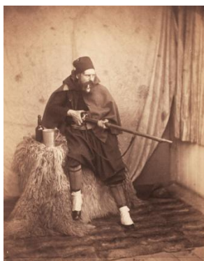
003 ROGER FENTON (1819–1869) Self-portrait in Zouave uniform, 1855

Salt paper print from wet collodion negative, mounted on original paper page 20,7 x 16,3 cm original page with captions from portfolio, Manchester publisher Thomas Agnew & Sons, 1956