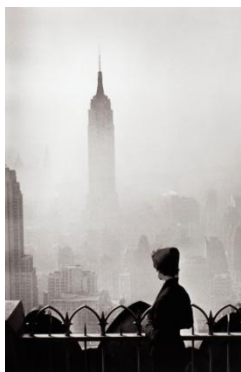
001 ELLIOTT ERWITT (* 1928) Empire State Building, New York 1955

Image material may only be used in connection with coverage of the 20th WestLight Photo Auction (12 October 2019) . Images must not be cropped or retouched. Image files must be removed from the archives after use.